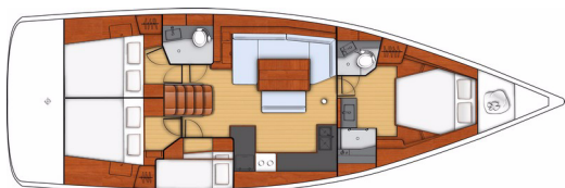
4 cabins - 2 head compartments