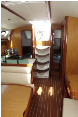
Main salon looking aft