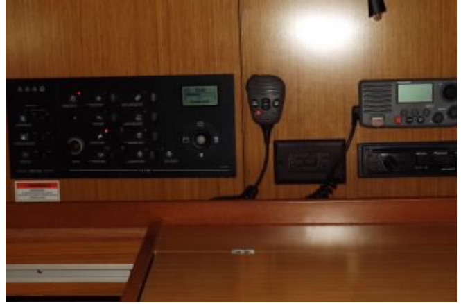
Electric panel and radios