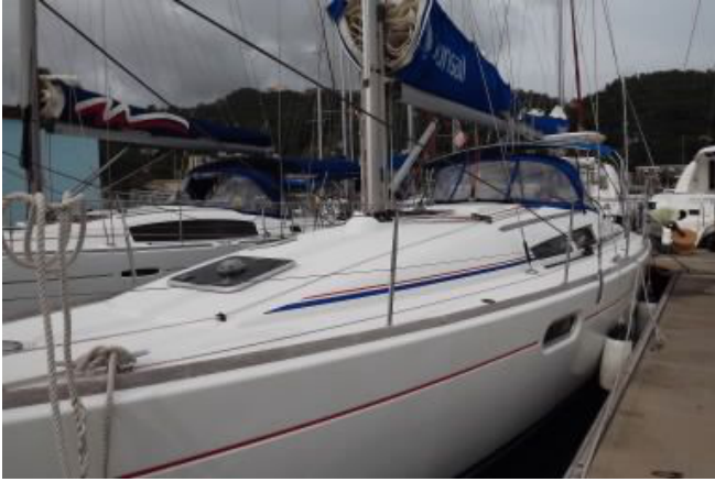
At the dock