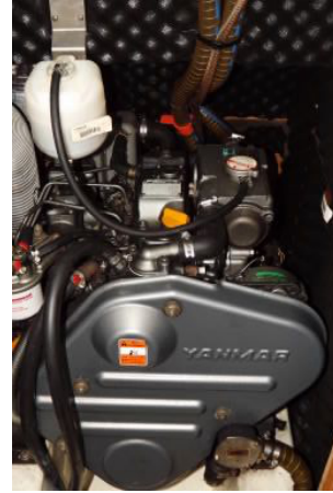
Engine close up