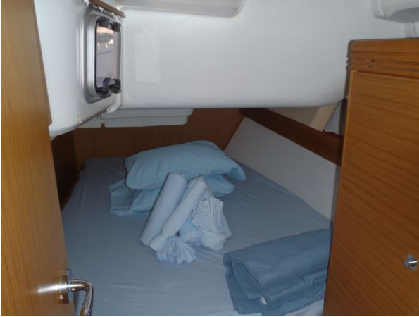
Aft port berth