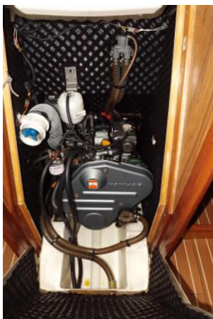
Engine access under steps