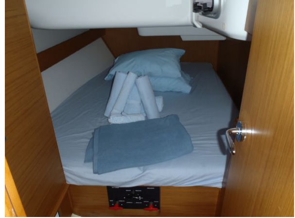
Aft starboard berth