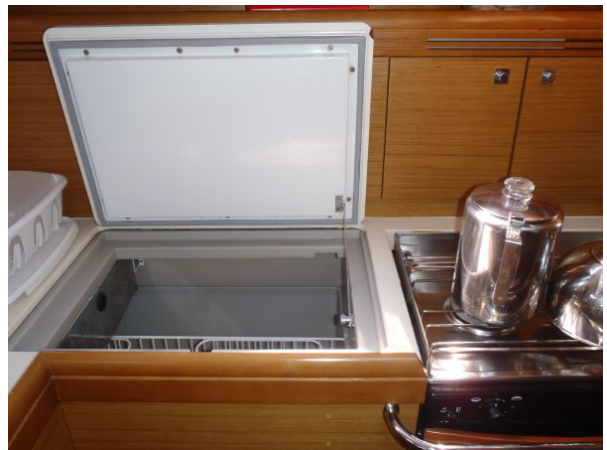
Galley top loading refrigerator