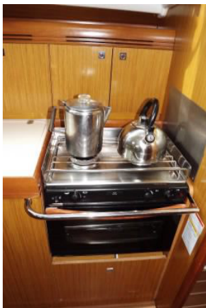
Gimbaled two burner stove with oven and broiler